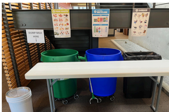
Waste Sort Station