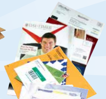
mail, magazines, mixed paper and catalogs