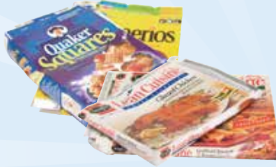
paper or frozen food boxes