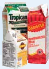
milk and juice cartons

PREPARATION clean · dry · quick rinse for milk and juice cartons